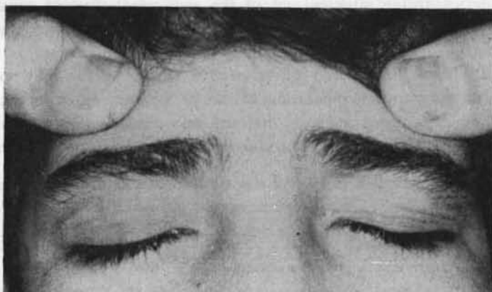
Complete ptosis when the eyebrow in normal position.

Blood: Inorganic phosphorus 8.0 mg%; creatinine 1.36 mg%; creatine 2.71 mg%; total calcium 8.5 mg%; glucose 92 mg%; urea 23.1 mg%; uric nitrogen.