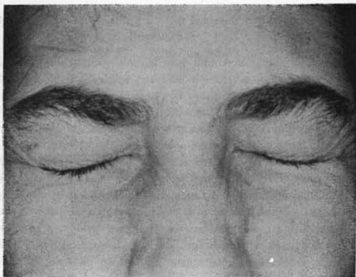
The orbicular muscles are normal.

Personal History: At the age of one year she had a "Suppurative infection" in one ear which lasted for two years; the measles at three years of age; whooping cough at nine, smallpox at eleven, menarche ten months ago, and an irregular cy-